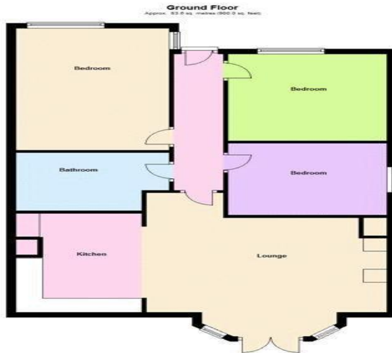
Total area: approx. 83.6 sq. metres (900.0 sq. feet) Floor plans provided for illustration purposes only. Not to scale. All measurements are approximate. Plan produced using The Mobile Agent.